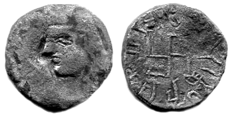
(a) Tooled billon drachm