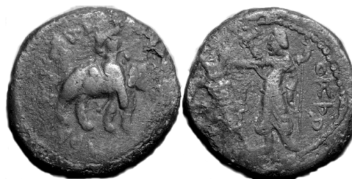
Figure 8: A genuine Huvishka bronze with a die flaw

This coin calls to mind another unusual Kushan coin that was recently published as genuine: an elephant-rider Huvishka bronze showing “Siva cursing Apasmarapurusa,” 83 and one begins to wonder if this also is a tooled forgery. The coin’s reverse showed a normal four-armed Siva, with the legend ΟηβΟ at right, but a seated figure at left where the tamgha normally would be. The presence of this figure is what was interesting and unique about this coin and made its publication worthwhile. But, after seeing the coin in Figure 7, it behoves us to question the genuineness of the Huvishka coin also — it could be the product of the same workshop, working with the same idea of adding figures to otherwise normal coins. The figure on the Huvishka coin interrupts the circular dotted border of the reverse design, rendering it clear that the figure was not an element of the original design. Was it added as an afterthought by the original die-cutter? Or was it added by a modern forger, attempting to create an interesting, unique, coin out of a common bronze? If the latter, it was obviously done well enough to fool experts such as Boppearachchi and Pieper.