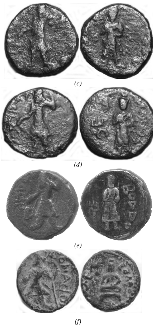
Fig. 6: Tooled “Buddha” bronzes of Kanishka

Lastly, I recently saw the photo of a rather unusual coin that had been sent to the British Museum for identification. 81 The coin, seen in Figure 7, is a normal Kanishka tetradrachm or full unit, with a deity, most probably Athsho, on the reverse, but with an additional seated figure (a “Buddha” according to the person who sent it to the Museum) at right.