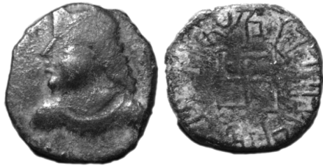
(b) Genuine coin of same type