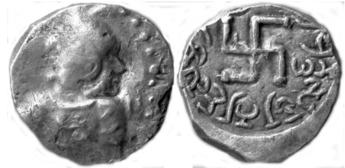
(a) Tooled coin with right-facing bust

portrait. But he had misunderstood the coin, which in fact features a left-facing bust. We can see it quite clearly in panel (b), particularly when we compare it with the coin in panel (c), a genuine coin struck with the same obverse die. In retrospect, the portrait in panel (a) now looks obviously tooled. Note the tell-tale “edge” created in front of the face in the right field, marking the point on the surface of the coin where the forger commenced “digging” into the coin to create the face. The details of the portrait also look obviously incorrect. This coin tipped me off that there was at least one workshop where Pāratarāja coins were being tooled, and led me to examine other coins with a greater sense of scepticism.