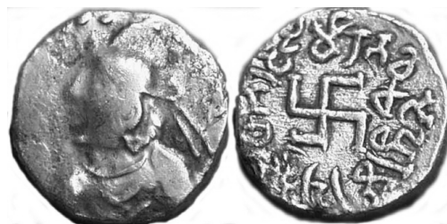
(c) Genuine coin struck with the same obverse die