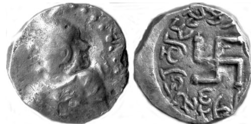
(b) Same coin with obverse turned to emphasize actual left-facing bust