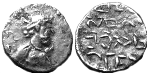
(b) Genuine coin