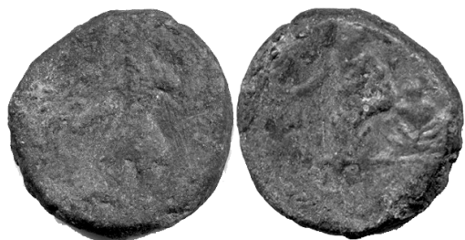
Fig. 7: A tooled Kanishka bronze with created additional figure

Lastly, I recently saw the photo of a rather unusual coin that had been sent to the British Museum for identification. 81 The coin, seen in Figure 7, is a normal Kanishka tetradrachm or full unit, with a deity, most probably Athsho, on the reverse, but with an additional seated figure (a “Buddha” according to the person who sent it to the Museum) at right.