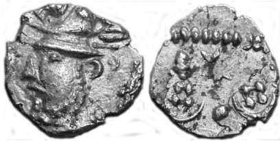
Figure 1: Fantasy “Indo-Parthian” gold coin Weight = 1.25 g, Diameter: 10-11 mm.

The two coins in Figure 2 present an example of this that was discussed recently on the South Asia Coins Discussion Group. 74 No two ancient coins are exactly alike. With die-struck coins, there were always at least small differences in the centering and depth of the strikes, and even with cast coins there would always be some differences in the casting. Moreover, on all ancient coins there would be differences in wear over the years. Thus when we see two coins as identical as the two in Figure 2, we can be quite sure they are modern forgeries. A third type of forgery is the tooled forgery, and that is the subject of this brief note. I have noticed a number of tooled forgeries recently of Kushan and Pāratarāja coins, and I thought it worthwhile to bring these to the attention of collectors.