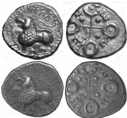
Figure 2: Mould Replicate Forgeries of a Satavahana coin

A tooled forgery is a coin where a forger has taken a genuine coin and has then used tools to either “enhance” the detail on the coin or to alter the coin in some significant way. Tools are also sometimes used to clean coins. Some coins may emerge from the ground so heavily encrusted that it is impossible to tell what the coin is.