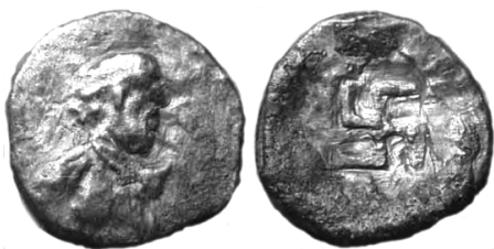
(a) Tooled coin

A third example is another Pāratārāja coin that had me fooled enough that I published the coin as genuine. 78 But after seeing the previous two coins, I decided to re-examine it, and I have now concluded that it is false. I believe the coin was originally a normal quarter drachm of the Pāratārāja, Yolamira. Figure 5 shows the coin in panel (a) along with a genuine coin struck with the same obverse die (and possibly the same reverse die) in panel (b). Here, both sides of the coin have been heavily tooled. We see the now-familiar “edges” on both the front and the back. Details around the neck and the back of the head show that the obverse die matches the one on coin (b), but the facial features have been entirely created. 79 More egregious is the reverse. When it emerged from the ground, the reverse must have been very heavily encrusted: we see the remnants of that encrustation around the edges of the coin even now. So the coin presented a blank slate and the forger had to decide what to create on it. Since almost all Pāratārāja coins have a swastika on the reverse, it must have seemed logical to the forger to insert a swastika here as well. But the Yolamira quarter drachms actually do not have a swastika reverse, as we see from the coin in panel (b). Unfortunately the actual reverse design has been obliterated in the process of tooling the coin.